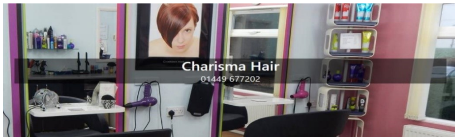
Charisma Hair 01449 677202

86a Forest Road, Onehouse charismahair.co.uk / 01449 677202