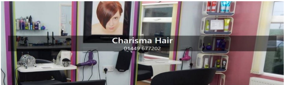
Charisma Hair 01449 677202

86a Forest Road, Onehouse charismahair.co.uk / 01449 677202